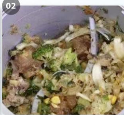
Smash to pieces