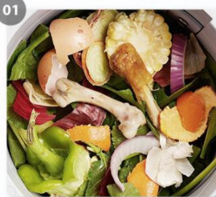
Crush the hard bones