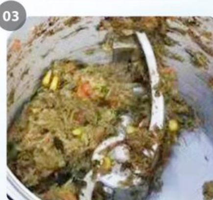
High efficiency dehydration